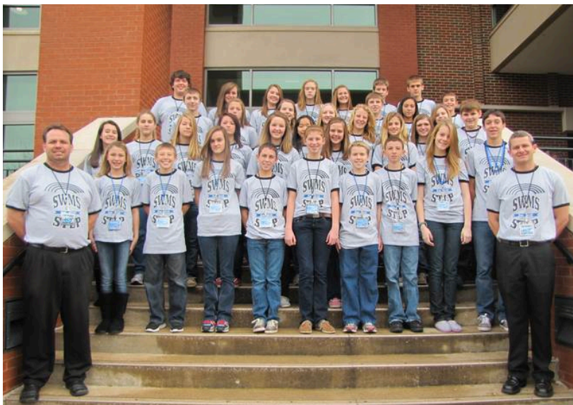
South Warren Middle School's STLP!

South Warren Middle School's STLP did an outstanding job with their Fall Showcases and Winter Virtual Judging Projects. The STLP group at South Warren has more projects accepted to the annual State Competition than any other school in Kentucky! The STLP State Competition will be held, March 22, at Rupp Arena in Lexington, Kentucky! The group will spend the day at Rupp Arena displaying either their showcases, working on live events, or checking out the other school's